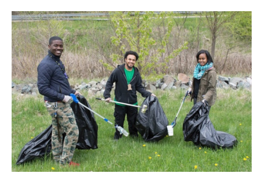
❖ Campus Clean Up