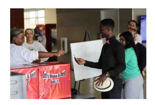
❖ Gaia Poetry Slam/ "Let's Make a Deal" -Sustainability Edition