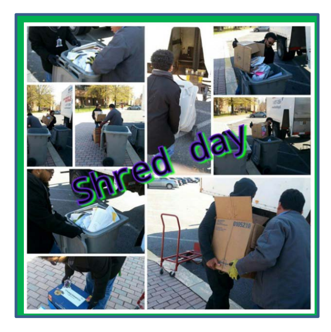
❖ Fall 2014 Shred Day