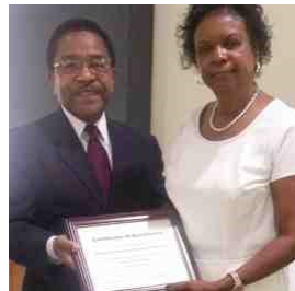
Elementary & Secondary Education