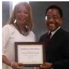
Child & Adolescent Studies