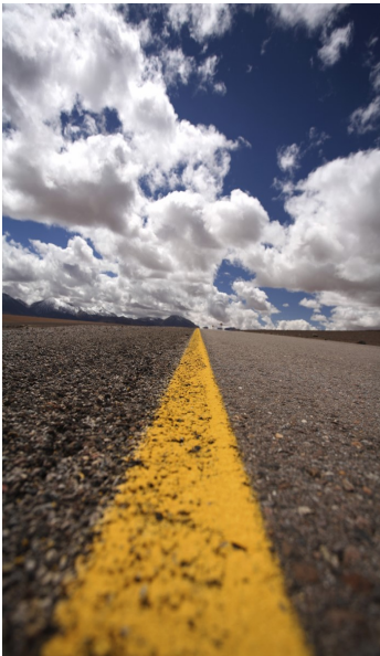
On The Horizon:

In fall 2017, the Center for Academic Programs Assessment is gearing up to conduct the HEIghten and WAVES national pilot studies of student critical thinking and writing skills, civic engagement, and intercultural competency. BSU is one of several universities participating in these national studies, supported by US Department of Education and Educational Testing Services.