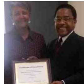
Early Childhood & Special Education