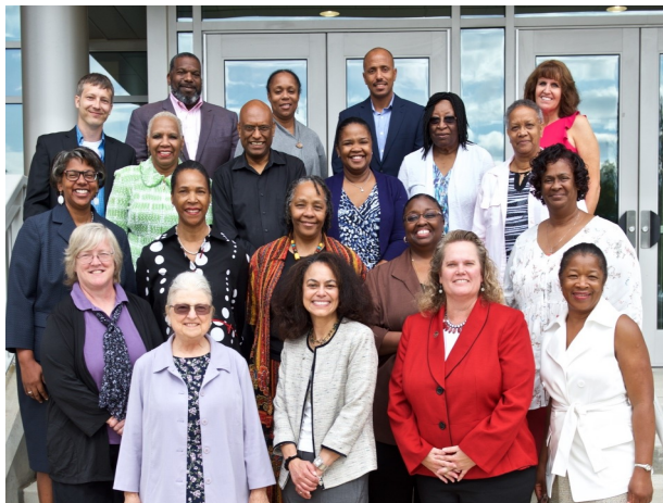
Pictured above: current and former members of the University Student Learning Assessment Committee (USLAC), a faculty senate committee

In late summer 2018, Bowie State University was recognized as one of five higher education institutions named as a 2018 Excellence in Assessment (EIA) designee. This designation spotlights institutions that successfully integrate assessment practices across campus; provide evidence of student learning; and use assessment results to guide institutional decision-making and improve student performance.