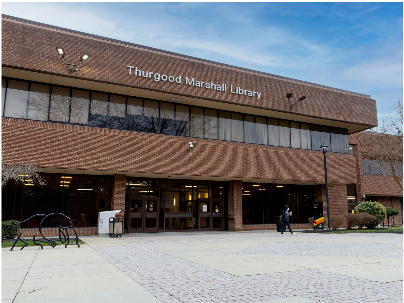
Thurgood Marshall Library

Not only do our faculty and students deserve 21st century, first-class academic facilities, but the workforce demands it, and our growth and competitiveness depend greatly upon it. I thank you for your support for funding for our new Martin Luther King, Jr. Communication Arts and Humanities building. We urge your consideration for funding to begin planning for our library renovation.