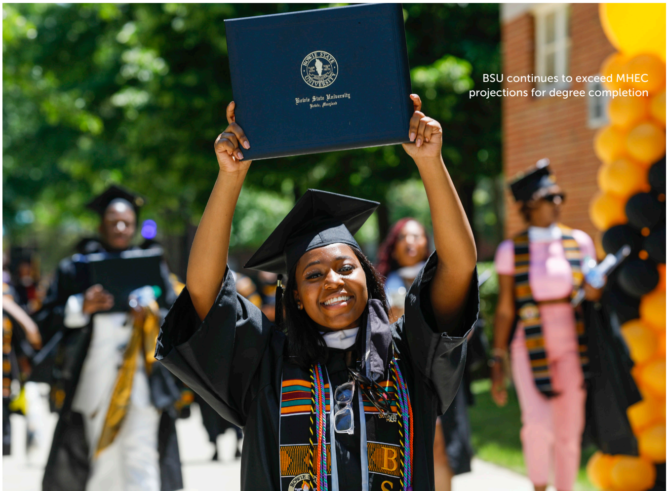
BSU continues to exceed MHEC projections for degree completion

We completed the update to our Facilities Master Plan to align it with the FY 19–FY 24 Racing to Excellence Strategic Plan . The plan (which may be viewed here ) lays the groundwork for continued growth and academic innovation and makes a strong case for major investment in new and renovated facilities. Moreover, with the implementation of SB1/HB1 signed by the Governor in 2021, an infusion of operating funds beginning in FY 2023 will support the development of several new, high demand academic programs to support Maryland's workforce. BSU's new "niche" programs will draw on our strengths in cybersecurity, computer technology, professional studies and education. It is imperative that our infrastructure keep pace with the growth in enrollment and academic program offerings.