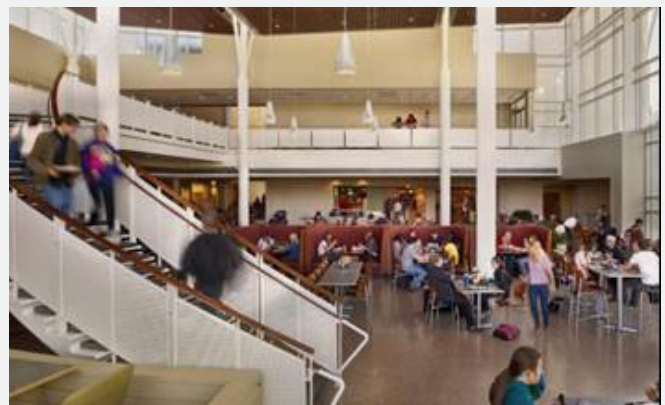
Proposed Academic Commons project

Thank you for your continued support for the Martin Luther King, Jr. Communication Arts and Humanities building. I urge your serious consideration for accelerating our new library project in the CIP, with planning funds in FY 2024.