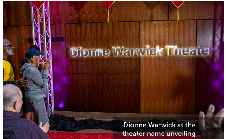
Dionne Warwick at the theater name unveiling