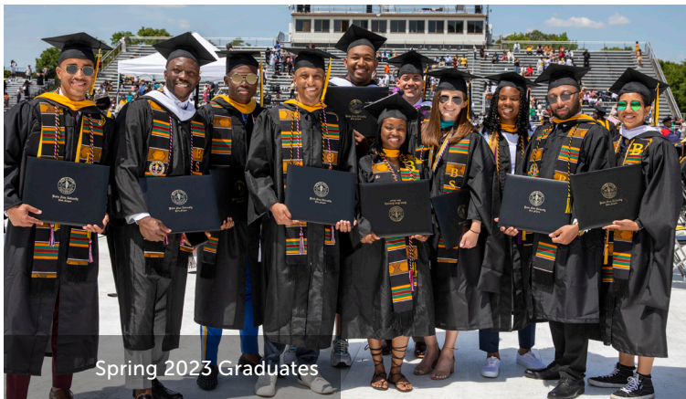
Spring 2023 Graduates

Bowie State University remains in high demand, demonstrated by continued upward trends in recent years. We received over 13,000 applications in Fall 2023. Full-time, first time degree-seeking freshmen enrollment has grown over 20% since Fall 2019. As we continue to develop stackable credentials in high-demand fields, graduate certificates, master's and doctoral programs, our graduate enrollment also continues to grow, with an increase of over 18% since Fall 2019.