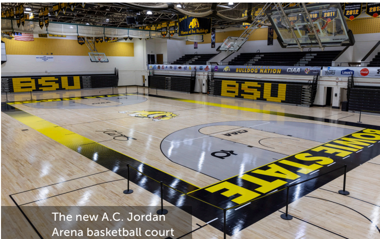
The new A.C. Jordan Arena basketball court