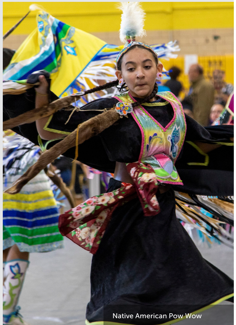
Native American Pow Wow

We hosted our inaugural Native American Pow Wow – the first authentic ceremonial Pow Wow ever held on a Maryland HBCU campus. A community celebration to kick off National American Heritage Month, the day was full of Native American cultural experiences focused on alarming social justice issues impacting the Native American community. The event included authentic food, games for children, musical and dance performances, and featured authentic Native American vendors. Attendees received free Ancestry DNA kits to trace their Native American heritage.