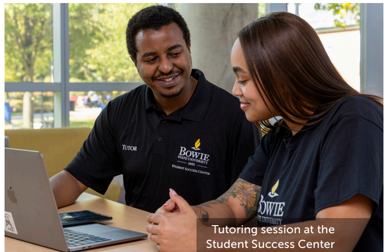
Tutoring session at the Student Success Center

The One Step Away Program (OSA) is a Maryland Higher Education Commission (MHEC) grant designed to increase college completion rates by providing bachelor's degree granting Maryland institutions with seed monies to identify, contact, re-enroll, and graduate near-completer students. Near-completers are those students who have earned at least 90 credits toward a bachelor's degree, but have stopped out or dropped out for more than twelve (12) consecutive months without obtaining a degree. Over seventy-five students have graduated with assistance from the One Step Away Program, which has been awarded over $500,000 in grant funds for the last ten (10) consecutive years. OSA continues to advocate for Bowie State students by providing tuition assistance, textbook vouchers, tutoring, and wrap-around support services. Each year, OSA graduates account for approximately 1% of the number of Bowie State University graduates.