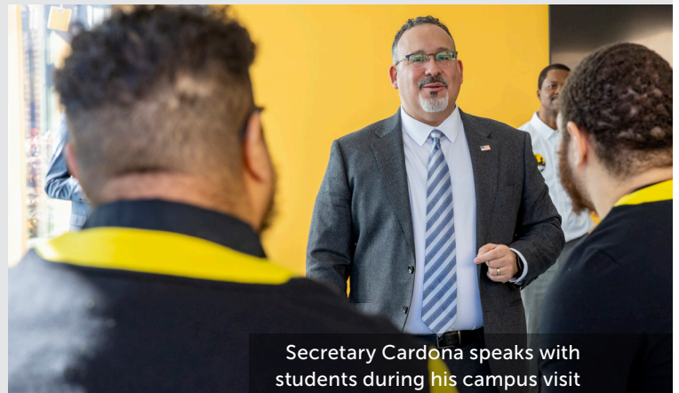
Secretary Cardona speaks with students during his campus visit