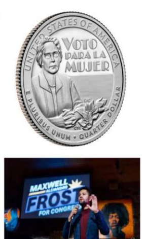
Sponsored by Department of Language, Literature, & Cultural Studies and Office of Multicultural Programs and Services