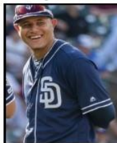
MLB Player Manny Machado

Submit answers at www.bowiestate.edu/hispanicmonthquiz by October 15.