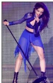
Singer Camila Cabello