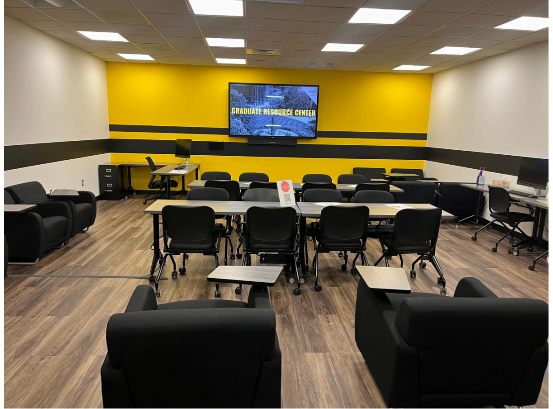
Thurgood Marshall Library, Room 1185

Looking for a space to study, collaborate with peers, or work on assignments? Visit the Graduate Lounge in Thurgood Marshall Library (Room 1185) . This modern space features seating for 30, 7 computers, 3 private study pods, and a large 80" interactive screen with virtual and touchscreen capabilities.